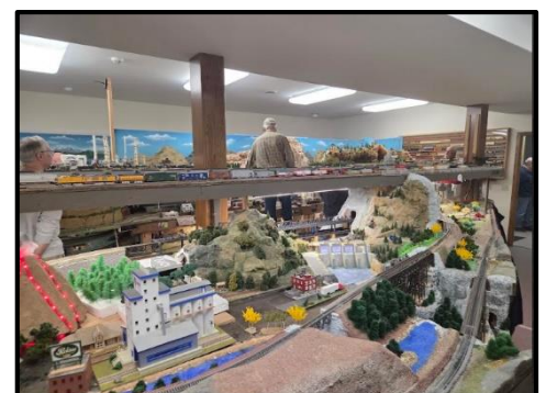
Slinger Railroad Club