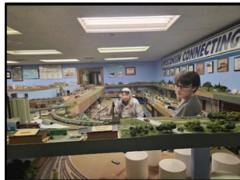
Kettle Moraine Ballast Scorchers