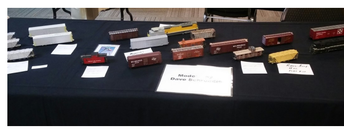
Shown above is Dave Schroedle's weathering table and below are some fine examples of Fred Firkus's oil paint based weathering.