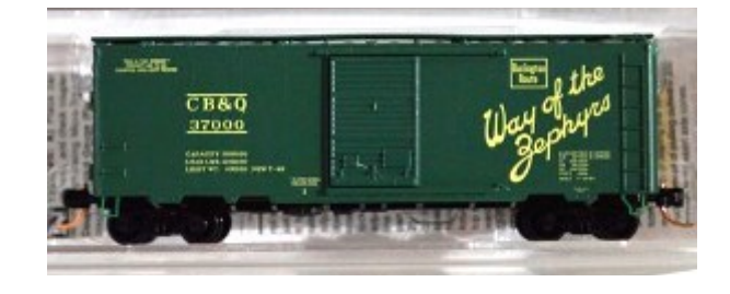
RTR N Scale Special Run car by MicroTrains shown above and Accurail HO Scale Kit of the same car below.