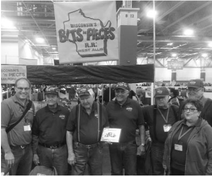
Bits 'n Pieces last time at Trainfest

In my opinion Trainfest 2017 was a great success. During the show feedback from all exhibitors was positive and vendor sales were good. We had good participation in the Make & Take and Jr. Engineer Programs and the Historical Display on the SOO Line was well received. Attendance was up from 2016. Here are the numbers for 2017