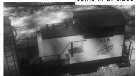
Below: Power came in all sizes