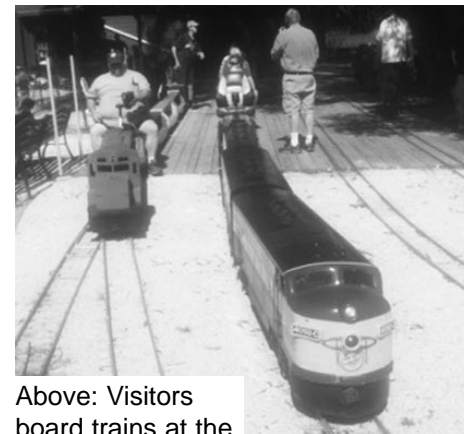
Above: Visitors board trains at the railroad park.