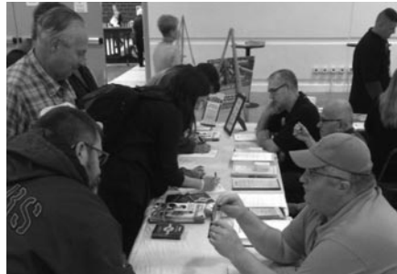
Volunteers at Trainfest 2015 sign up Junior Engineer participants.

In addition, Trainfest will be hosting the winning high school team from the Japanese National Module Contest. The team will give presentations on both Saturday and Sunday at 4:00 p.m. and will have the winning module as part of the MANTRAK exhibit. Come and see quality modeling from another part of the world and give these folks a great Milwaukee and WISE Division welcome.