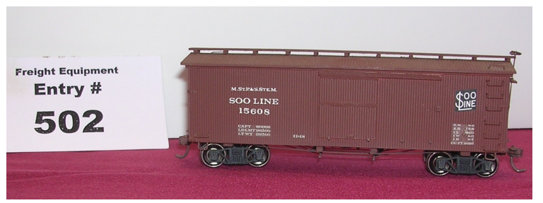
1st. Freight Equipment: SOO Line Reefer by Randy Bingham