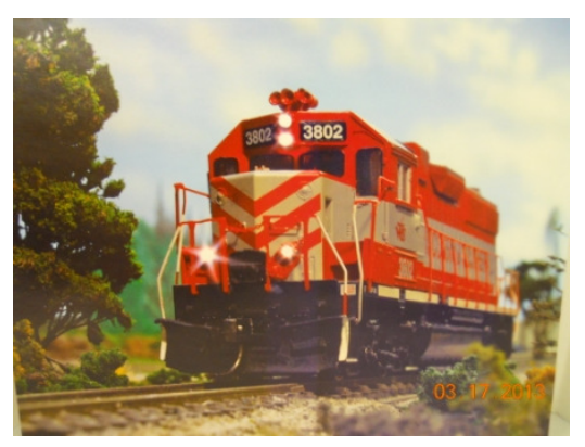
2nd Place Model Photo Charlie Schulz Wisconsin Southern #3802