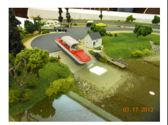
Best Of Show Jim Sohns "Leister Lake" HO Module/Diarama

Complete Contest Category List:Motive Power—SteamMotive Power – DieselPassenger EquipmentNon-Revenue Freight EquipmentFreight EquipmentStructures (On and Off Line)General (Dioramas & Trains)Traction/ElectricModel PhotosPrototype PhotosTrain Related Crafts