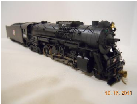
Best of Show - Motive Power Steam Andy Breaker - CNW "Class J-4" 2-8-4 #2810