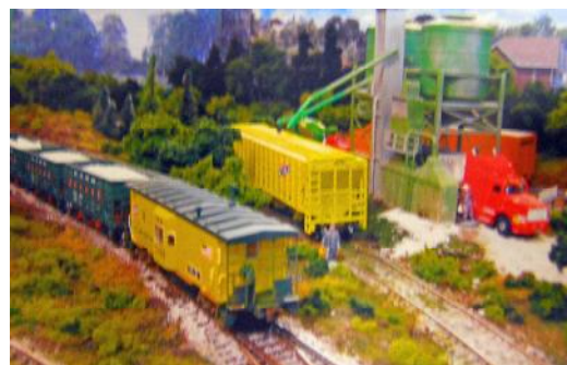
Model Photo - Dave Phillips "Rock Job"