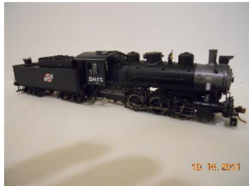
Motive Power Steam - CNW "Class M-3" 0-6-0 #2615