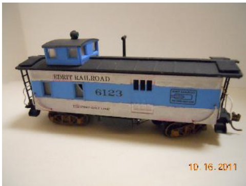
1st place Non- Revenue Freight Equipment Ed Varick - EDRIT Caboose