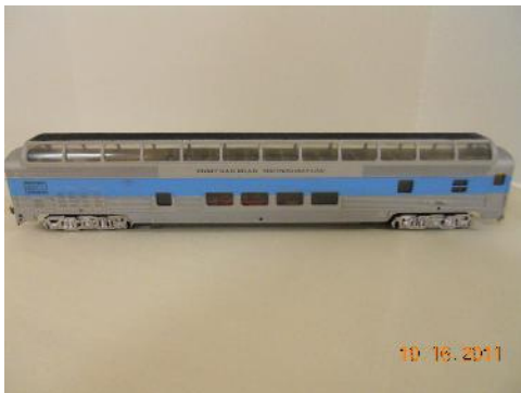
Passenger Equipment - Ed Varick EDRIT Superdome